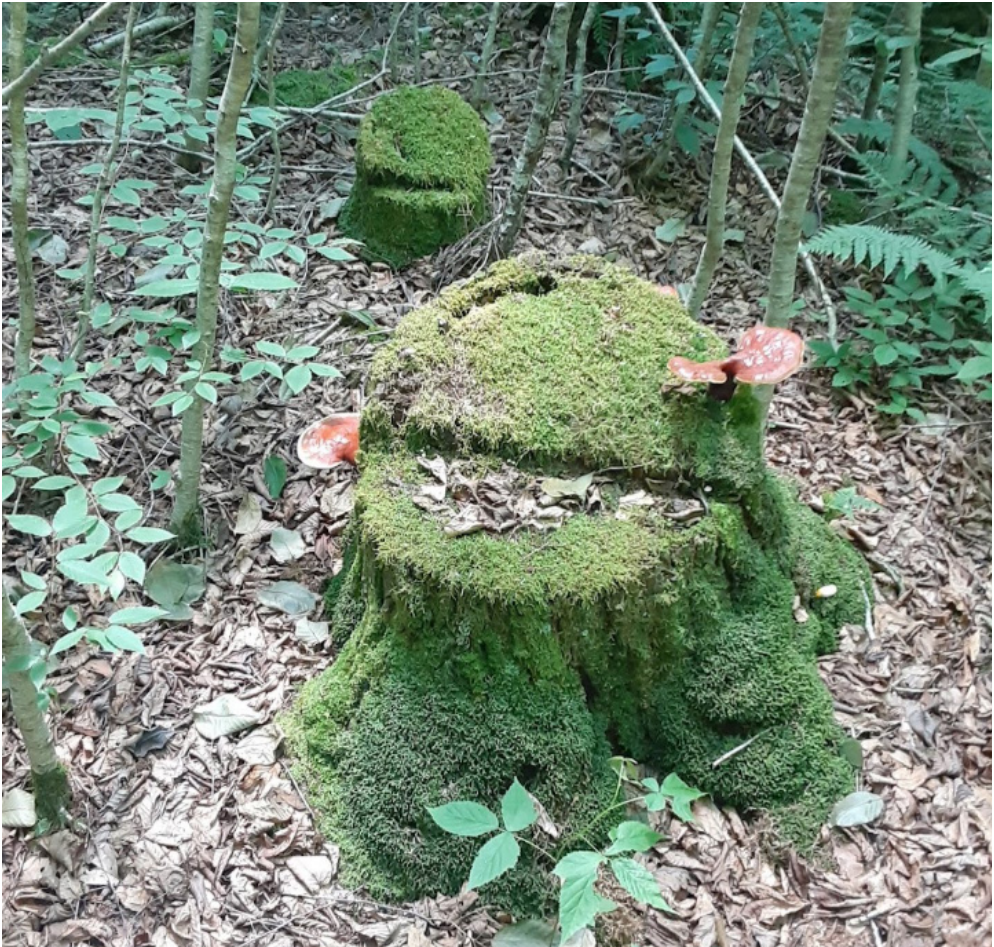
A view from the Cranberry Glade boardwalk.

Southern West Virginia is a paradise for hikers, offering a diverse range of trails that cater to all skill levels and preferences. Whether you seek adrenaline-pumping adventures or tranquil walks amidst nature, the hiking trails in this region will not disappoint. So, lace up your hiking boots, grab your backpack, and embark on an unforgettable journey through the majestic landscapes of southern West Virginia.