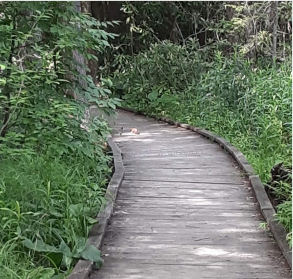
The boardwalk at Granberry Glade