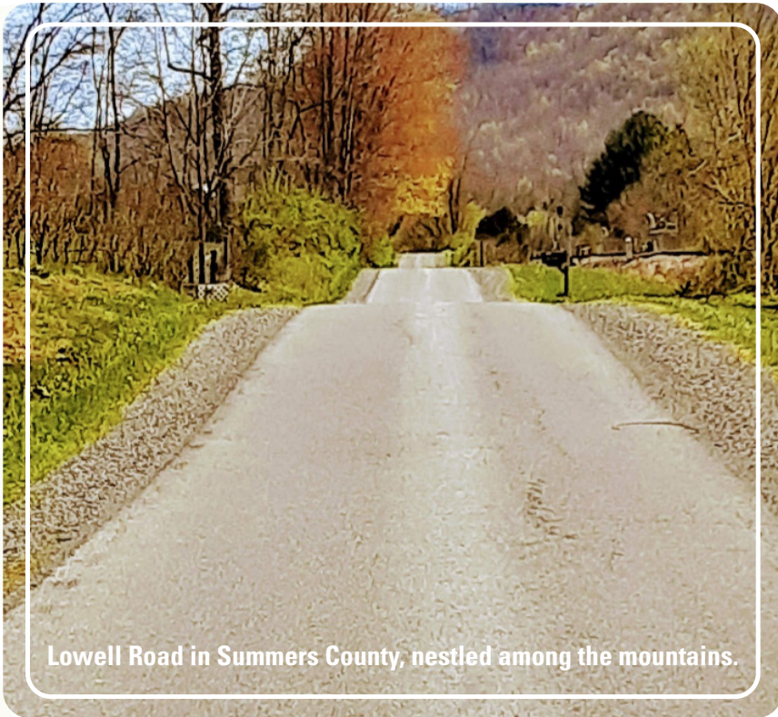
Lowell Road in Summers County, nestled among the mountains.

Relays, races, marathons and hikes are always in abundant supply in this mountainous region. The landscape guarantees beauty as well as varying degrees of difficulty. Also, our state parks and hidden trails provide runners, bikers and hikers with a safe place to enjoy the almost heavenly forests, lakes and rivers these events provide for them.