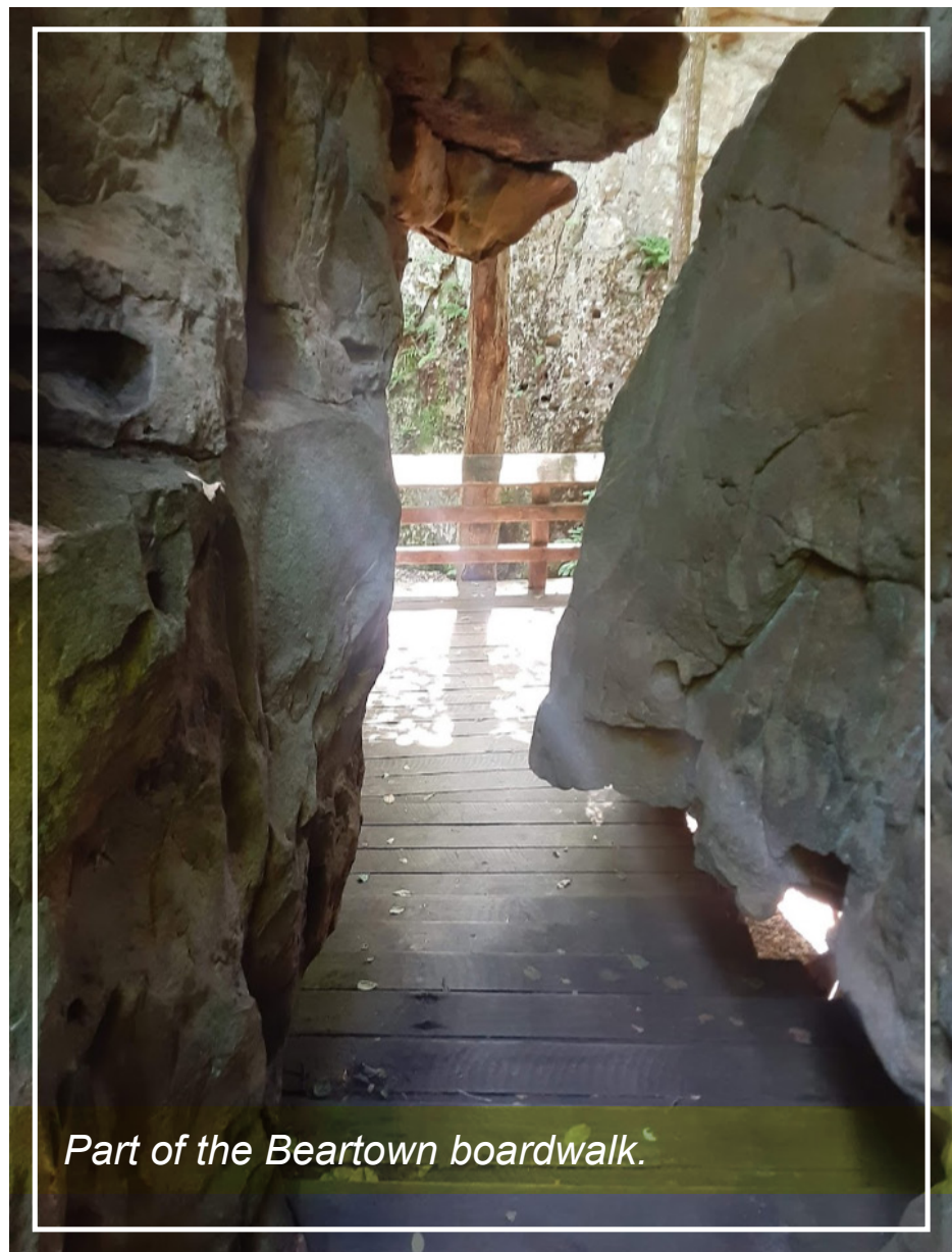
Part of the Beartown boardwalk.

Southern West Virginia is an incredible place for outdoor enthusiasts, offering a plethora of breathtaking hiking trails. From rugged mountain peaks to serene river valleys, this region is a haven for nature lovers. Let's explore some of the best hiking trails in southern West Virginia, each offering unique experiences and stunning vistas.